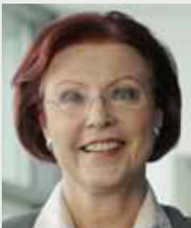
HEIDEMARIE WICZOREK-ZEUL GERMAN FEDERAL MINISTER FOR ECONOMIC COOPERATION AND DEVELOPMENT

As the 21st century gets underway, the world is faced with huge challenges that can only be mastered through joint international efforts. Simultaneously, new crises are threatening to make people's living conditions, particularly those of people in the developing countries, worse.